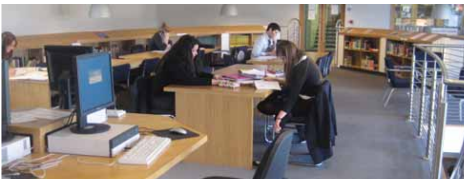
6th formers at work on the mezzanine floor