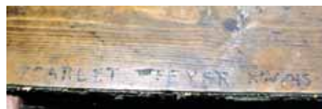
Old Pocklingtonian graffiti

One interesting minor discovery was in the large back bedroom which had originally been the school san with its own separate staircase. When the carpets were lifted it was found that boys had used pokers heated in the fire to burn graffiti on the floorboards. The dates seem to cluster from about 1917 to the late 1940's. One reads 'SCARLET FEVER NOV 1945'.