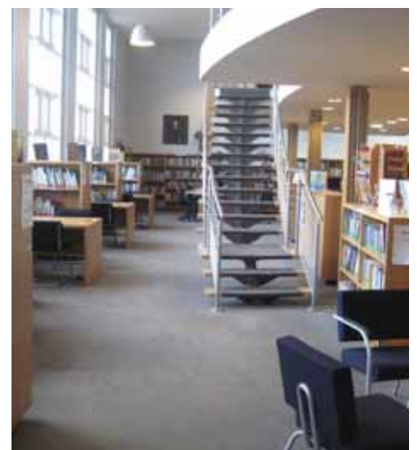
A view of the new library