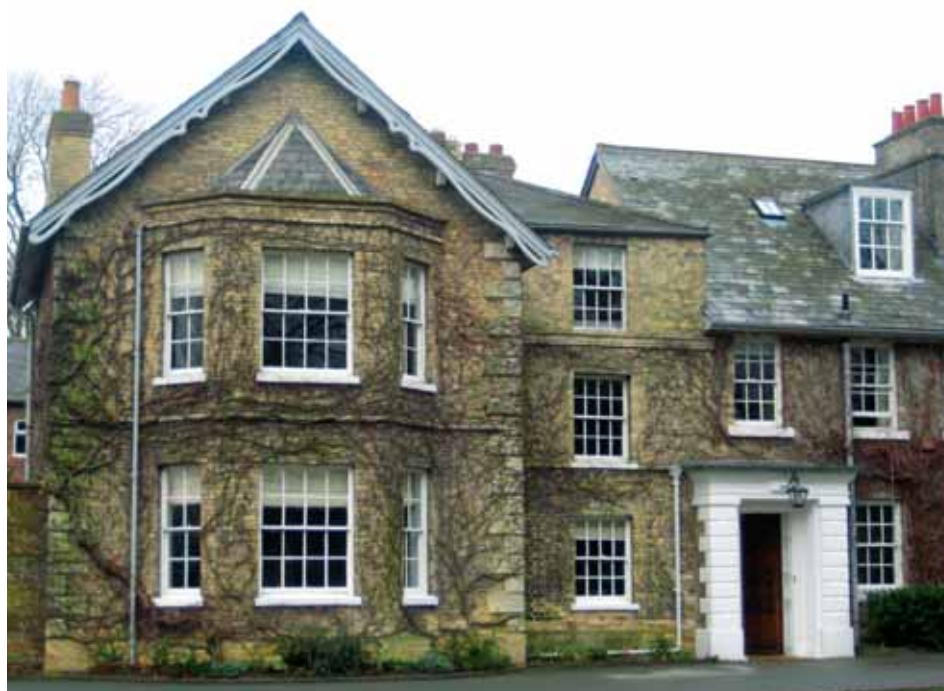
The Headmaster's residence

An architectural history of the school buildings is being planned. Expect some surprises.